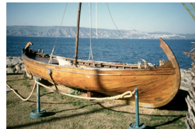
This is a replica of a 1 st century Galilean fishing boat uncovered in the Sea of Galilee in 1986. It is 27 feet long and is likely very much like the boat used by the apostles.

Peter was a pro. He knew this was neither the time nor place. Peter did not embarrass Jesus by saying as much. Instead, he simply said, “Master, we