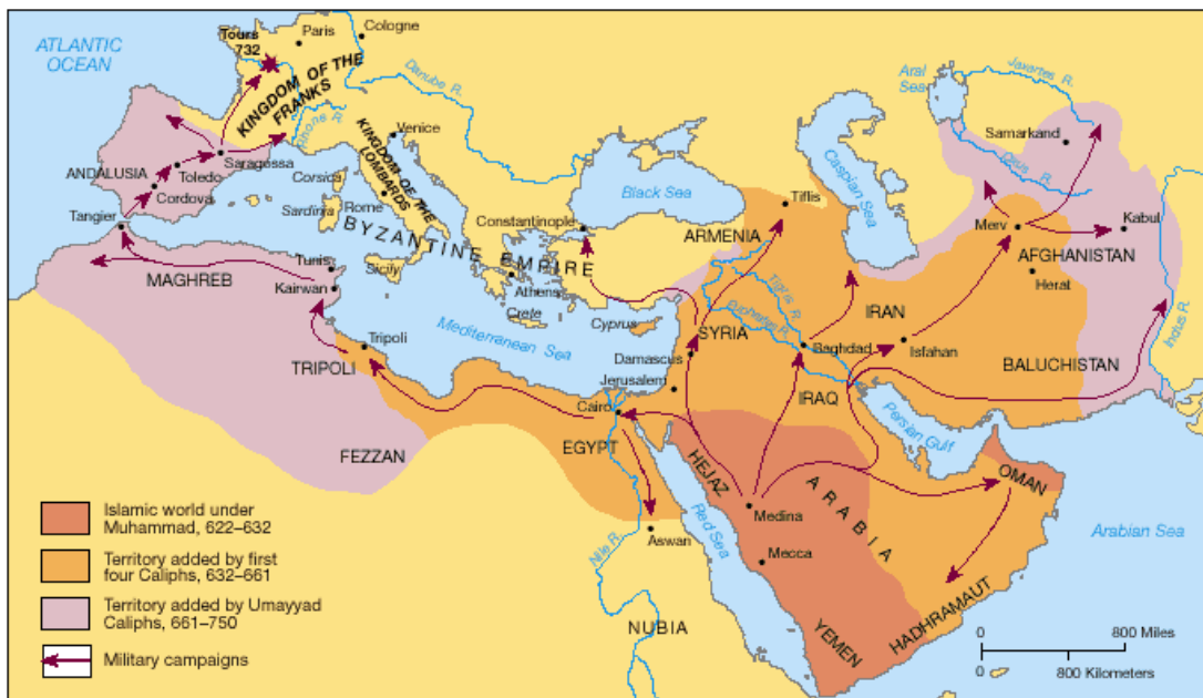
The Spread of Islam. The rapid spread of Islam created within a century a unified cultural and economic zone from India to the Atlantic Ocean within.

Some thought that Muhammad meant to transfer his temporal authority to Ali, his son-in-law. Others put up a man named Abu Bakr as their new leader. Abu Bakr seemed to get the greatest number behind him and he started collecting the various pronouncements of Muhammad into one place (what became the Koran). Abu Bakr did not live long and was succeeded by Umar. Umar continued the military conquests of Muhammad and conquered the Sasanians. This brought Islam right up to the border of the Byzantine Empire as well as India. When Umar died in 644, Uthman succeeded him and conquered much of North Africa as well as the island of Cyprus in the Mediterranean.