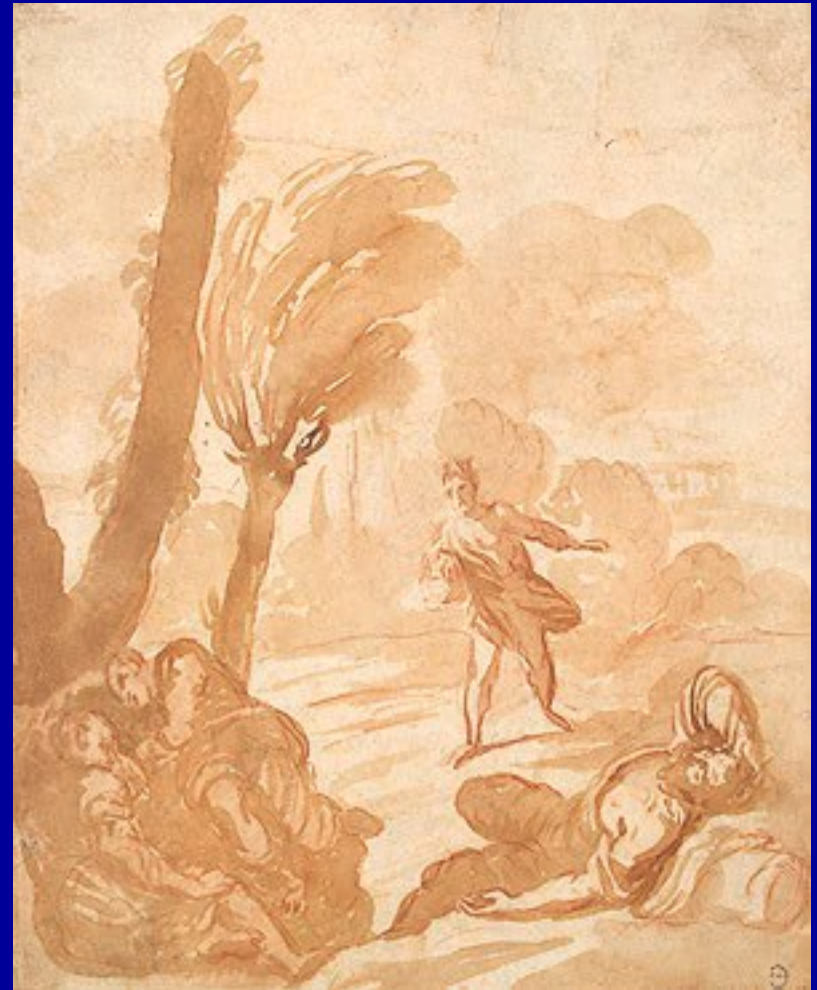
Fetti Early 1600's